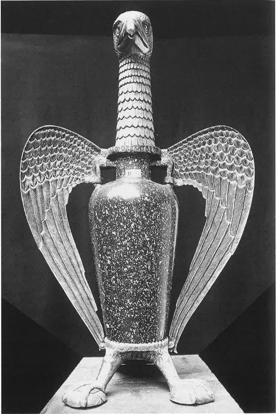
FIGURE 11-3 The Eagle Vase of Suger, c.1140–4. Paris: Louvre.