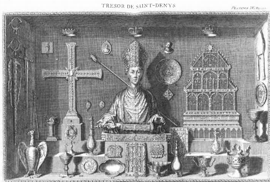
FIGURE 11-4 The Treasury of St Denis, including the Eagle Vase and other objects made for Abbot Suger. From Michel Félibien, Histoire de l'abbaye royale de Saint-Denis en France , plate IV. Paris: 1706.

the discussion of spolia . Most Roman gems and other curios must have come into their donors' possession by inheritance, gift, commerce – all attested to by Suger – and excavation, as at Verulamium. Exceptions would include the treasures that came west after 1204 as a result of the Crusaders' plunder of Constantinople, which might be classified as true spolia , that is, spolia in the classical (and medieval) sense of the word. The same might be said of objects obtained via the Seljuk dispersion of the Fatimid treasury in Cairo in 1061, and of the Islamic luxury items that passed into Christian treasuries as a result of the Reconquest of Spain.