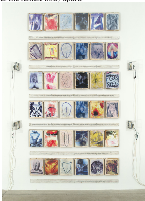
Carolee Schneemann, Vulva's Morphia , 1995, courtesy the artist and P.P.O. W. Gallery

This exhibition shows an artist focusing on the contradictions and connections engendered in the cultural and the personal body she inhabits, identifies, and constantly homes in on. Venus Vectors (1987) is the centerpiece of the exhibition. This large sculptural work incorporates transparent acrylic panels displaying iconographic images of the human body and other organic forms with two video monitors showing edited performances of Schneemann's Fresh Blood: A Dream Morphology . The work glitters with reflected and generated imagery, implicating the viewer and the surrounding space into the experience of the work. Fresh Blood insists upon what the artist articulates as a vulva-centric approach to explore menstrual blood and taboos which set the female body apart.