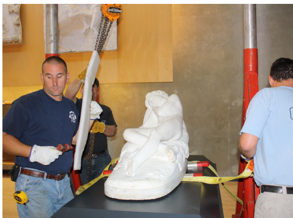
Endymion comes home