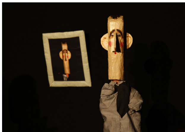
Finger puppet of Syrian President Bashar al-Assad.

Greek pottery combine to reveal a complicated portrait of the people and the cultures associated with these wares. From personal items to ritual objects, from pristine examples to enigmatic fragments, and from intimate depictions to mythic expressions, Sutton's selections will illustrate the breadth and the scope of the collection and offer insights into an ancient world that can seem simultaneously remote and familiar.