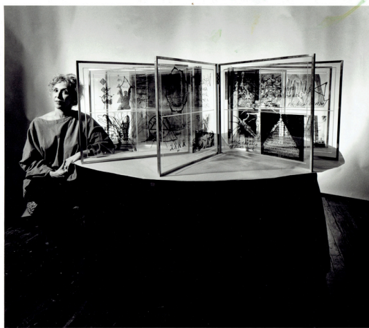
Carolee Schneemann with “Venus Vectors,” ca. 1985; gelatin silver print