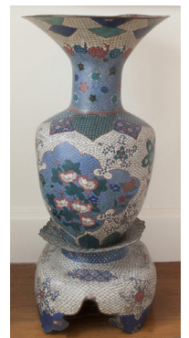
19th-Century Chinese Cloisonné Vase, from the Deanery. Now on display in Wyndham (W.719)

Read more at http://specialcollections.blogs.brynmawr.edu/2014/09/05/reconnecting-with-the-bryn-mawr-deanery/