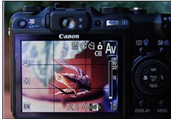
Figure 5. An evocative image of feedback

The metaphorical image that we have chosen is the focusing of a camera. We think that this image symbolises the focus of another person on what we do, an external point of view that allows us to notice the nuances that we were not fully aware of.